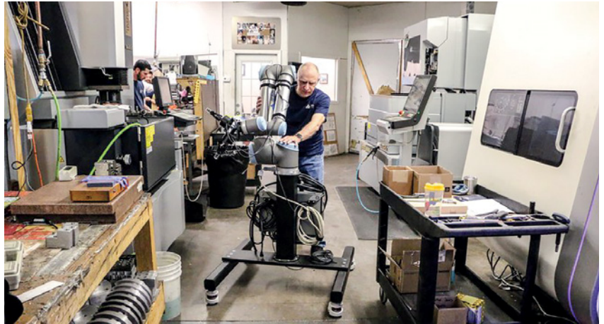
Cobots offer flexibility to be moved from one task to another, as shown in this rolling pedestal stand created by Texas-based All Axis Manufacturing.

“Our collaborative robots' built-in safety functions enable them to work right alongside workers, providing an effective social distancing option in the work environment,” explains Joe Campbell, senior manager, strategic marketing and applications development at Universal Robots. “Incremental automation enabled by