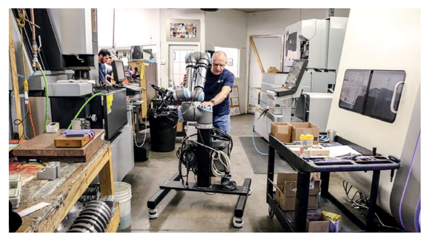
Cobots offer flexibility to be moved from one task to another, as shown in this rolling pedestal stand created by Texas-based All Axis Manufacturing.

He expects that RCM will have to leverage automation to restructure other work spaces, shifts, and even lunch times to keep workers safe. RCM isn't alone. For example, California's RSS Manufacturing has leveraged automation to